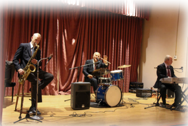
Great music all night