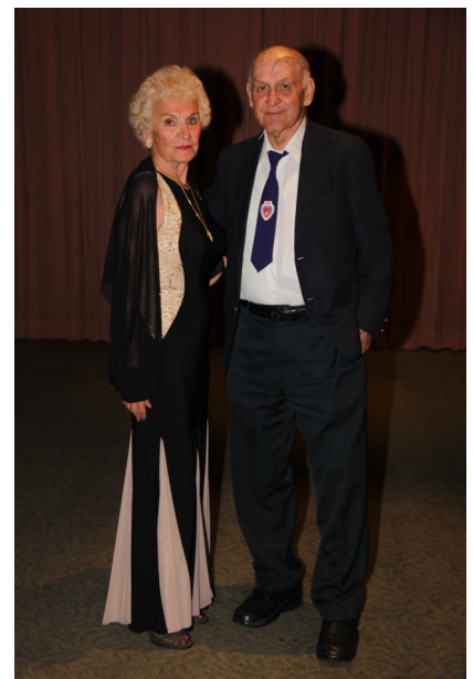
Ready to dance the night away!