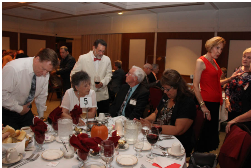
Meet & Greet Goes On For Hours!

"Thanksgiving, after all, is a word of action." - W.J. Camero