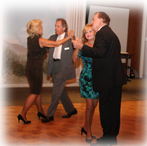
The Anniversary Waltz