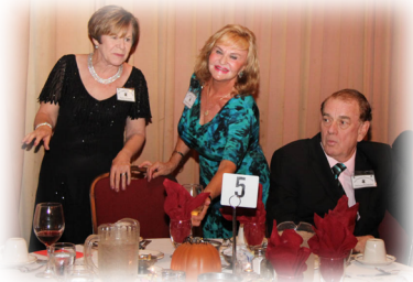
Meeting & Greeting