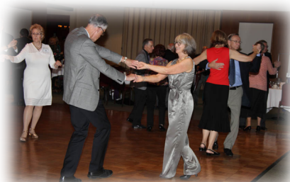
Rockin' and Rollin'