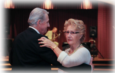
Romance is in the air