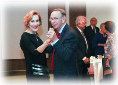
Kicking up the dust!