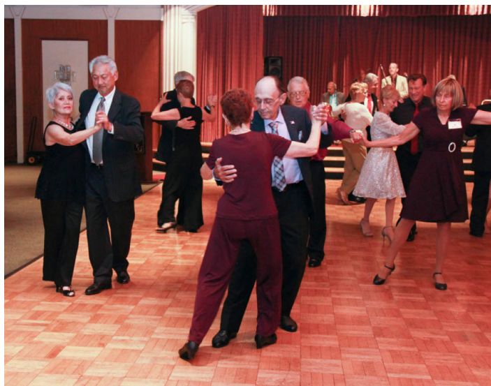
Everybody is up and dancing!

"O' pumpkin pie, your time has come 'round and I am autumnrifically happy!" - Terri Guillemets