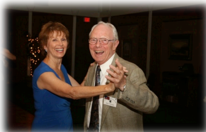
Greeters were busy