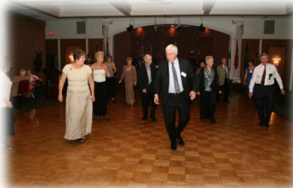
Kicking up our heels

December (Listeni/di: 'sɛmbər/dee-SEM-bər) is the 12th and last month of the year in the Julian and Gregorian Calendars and one of seven months with the length of 31 days.