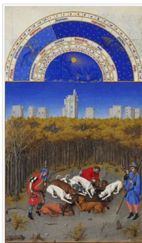
December, from the Très Riches Heures du Duc de Berry

In the Northern hemisphere, the beginning of the meteorological winter is 1 December. In the Southern hemisphere, the beginning of the meteorological summer is 1 December.