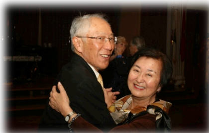
Turn turn turn