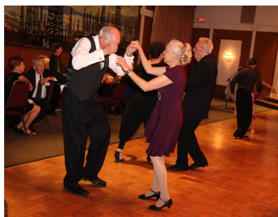
Rockin' and Rollin'