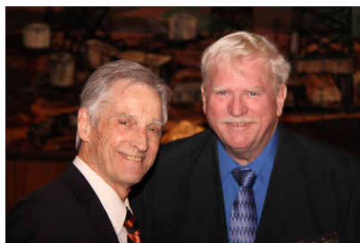
Checking out the dance floor