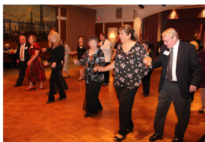
Line dance anyone?