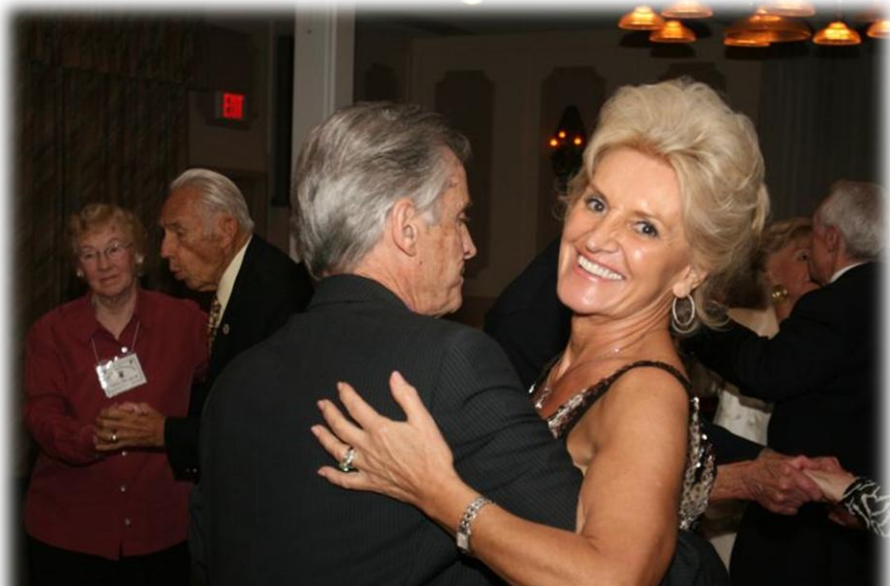
Mixing it up during the mixer!

You can dance anywhere, even if only in your heart. ~Author Unknown