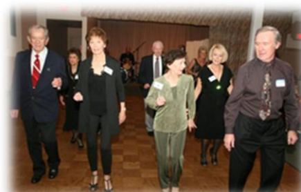
Beware, line dancers at work!