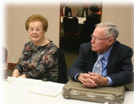
Serious work at the Board Meeting