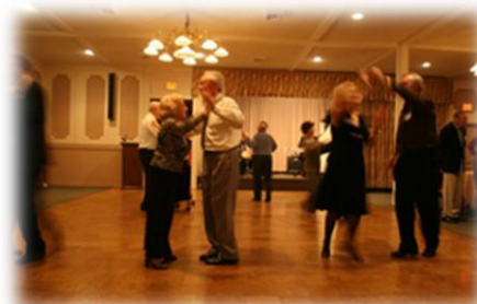
Dancing the night away