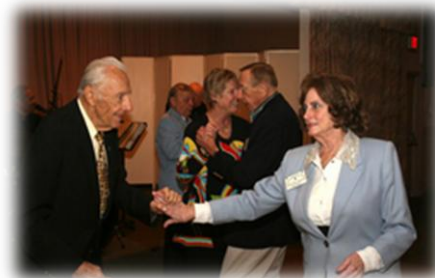
The mixer is always fun!