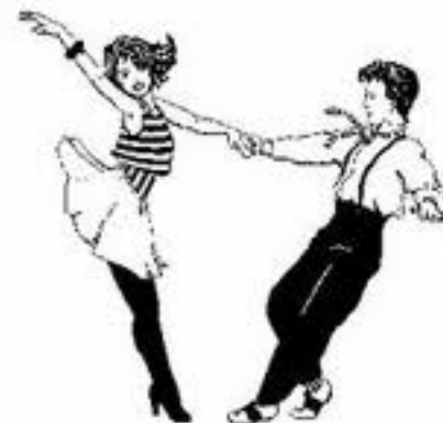
Go Toppers Go!