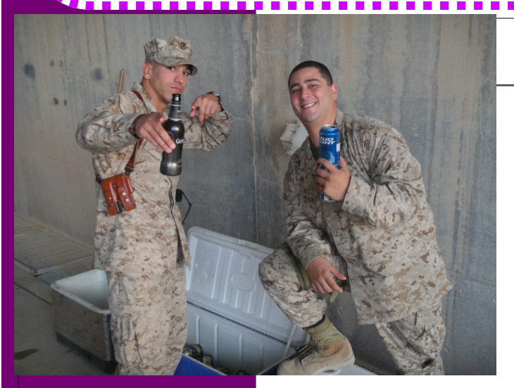
S-4 enjoys their beer after handing it out to the rest of the squadron and ensuring only two beers apiece!