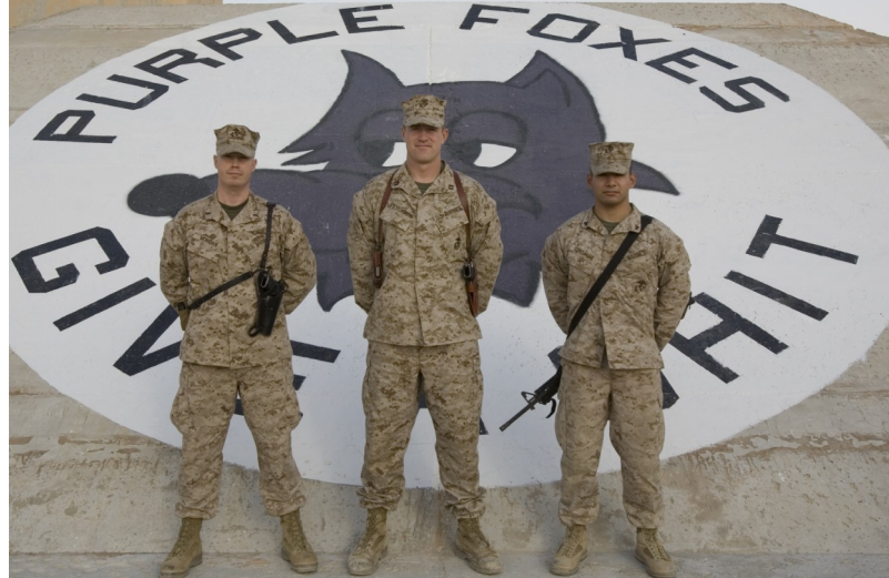
S-6 poses in front of the squadron mural on the Maintenance Day.