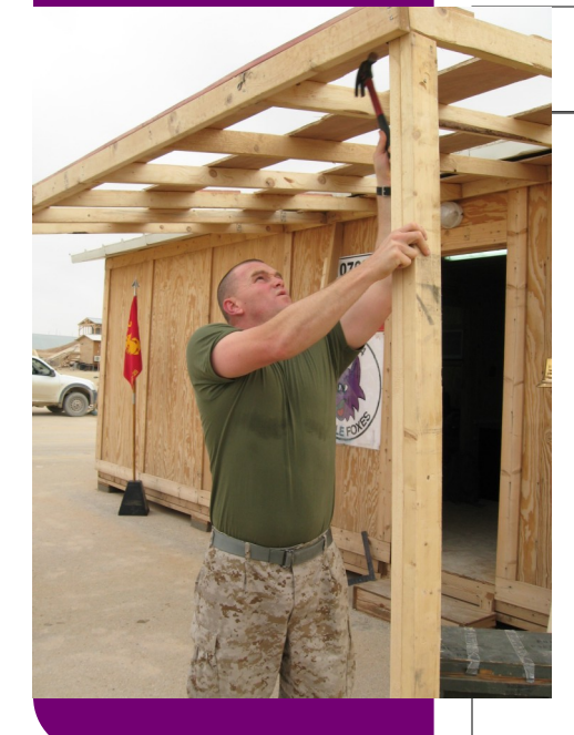
SgtMaj spent some free time building a porch for the Command suite.

P.S. Less than 25 days until Santa comes. Somebody please make sure he knows my deployed address. Thanks.